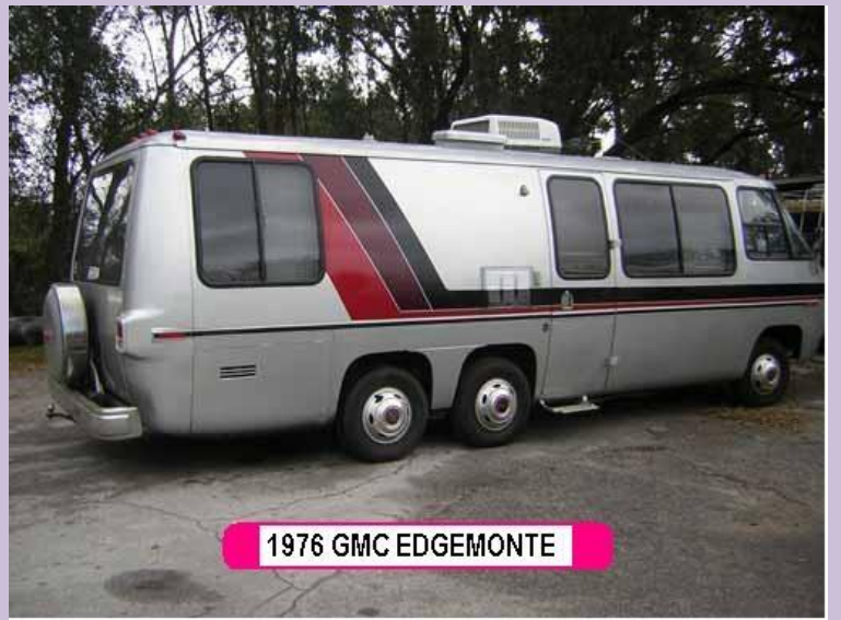
1976 GMC EDGEMONTE